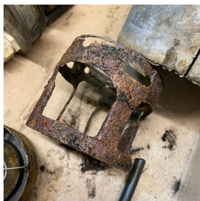
This stainless steel pump end suffered catastrophic failure due to a severely corrosive environment.

Sacrificial Anodes are often relied upon to protect water heaters, liquid distribution, storage tanks, and boat & ship hulls. Comprised of zinc, magnesium, and aluminum, they come in a variety of shapes and sizes.