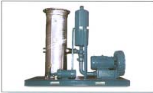
VES-RT7.5, vapor extraction system with regenerative blower, and optional condensate pump and discharge silencer