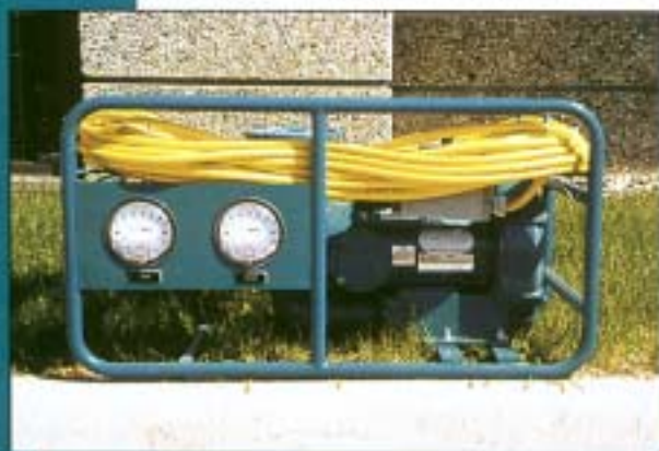
Portable vapor extraction package for pilot studies

EPG Companies Inc. custom builds solutions for industrial process systems, environmental remediation, leachate collection, and off-gas treatment applications. The EPG team operates on the theory that keeping the design as functionally simple as the application permits is the most cost-effective approach. This is not only the case initially but also as the project progresses with enhanced reliability, reduced maintenance and service, and lower operating costs. EPG hardware is matched exactly to the performance requirements of the job.