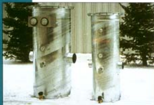
EPG's CS-24a and CS-16b condensate separators