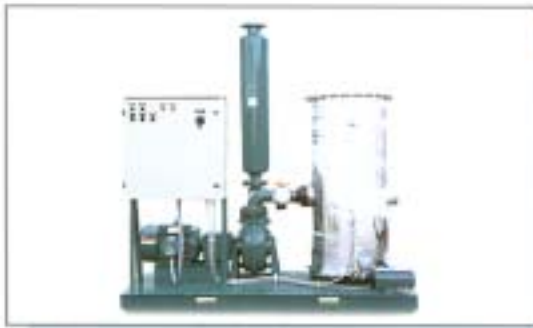
VES-CB20, vapor extraction system using a centrifugal blower