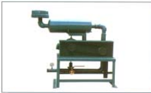
Stand mounted air sparge blower with heavy duty positive displacement blower