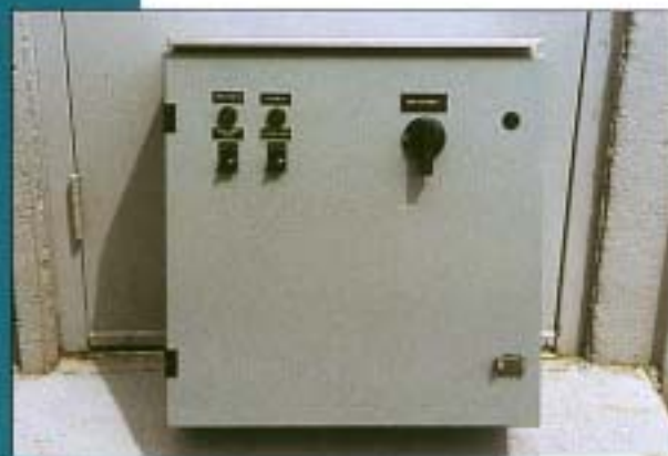
EPG's Series R755 Controller for vapor extraction and air sparge systems

COVER: Skid mounted vapor extraction systems with heavy duty positive displacement blowers.