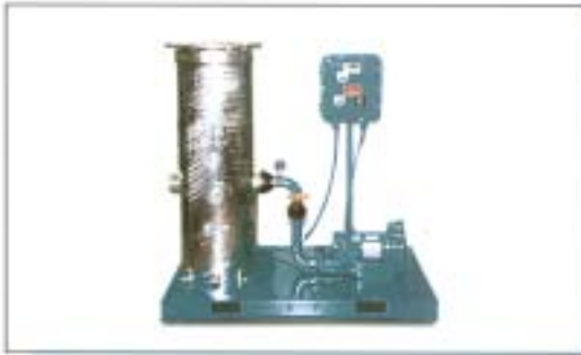
VES-RT1, vapor extraction system with regenerative blower and explosion-proof control panel