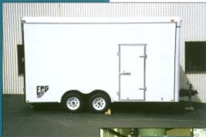
Trailer mounted vapor extraction and water treatment system

Whatever equipment and controls your remediation sites demand, EPG is your complete supplier. With over 3,000 installations worldwide, EPG equipment has proven to provide durable, trouble-free service. EPG's knowledgeable engineering and applications people provide the after-sale support that any system may need. Give EPG a call at (800) 443-7426 for assistance on your next remediation project.